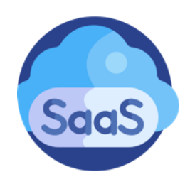
Software as a Service