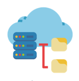
Cloud Infra Support